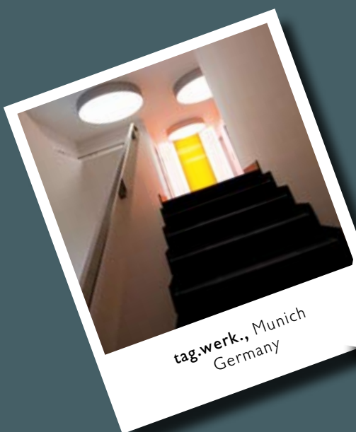
tag.werk., Munich Germany