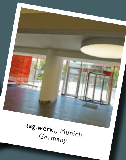
tag.werk., Munich Germany