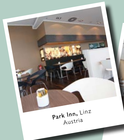
Park Inn, Linz Austria

The guests of the Park Inn Linz can stay in one of the 175 rooms spread over 7 floors. In addition to the underground garage the services of this new hotel are rounded off with the shopping area on the ground floor. Further attractions include four flexibly-designed conference rooms, a restaurant with a terrace, a cafe and a fitness complex with a great view of the city. The hotel was opened in May 2009. The good transport links (Linz Airport is just 15km away, and the main railway station 1.5 km) coupled with the furnishings of the hotel mean it is suitable both for business guests and tourists to the city.