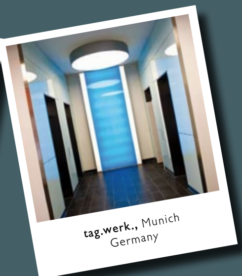
tag.werk., Munich Germany