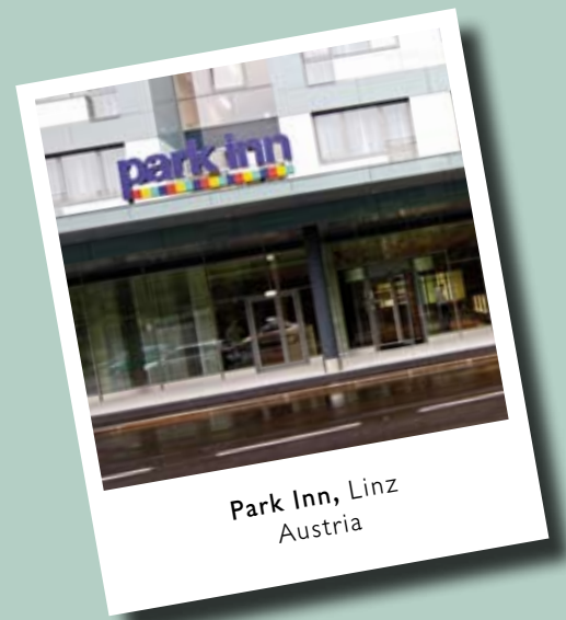
Park Inn, Linz Austria