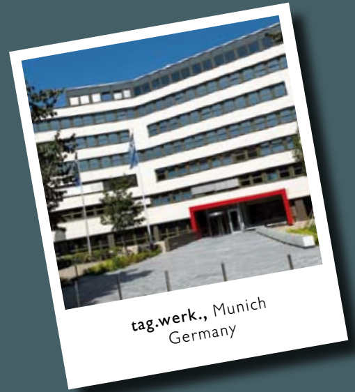
tag.werk., Munich Germany

Münchner Grund Immobilien Bauträger AG acquired the office building in 2007, together with a partner, and proceeded to modernise it extensively in 2008. In addition to an impressive new facade in a meandering style and an extension to the roof space (Penthouse), external parts of the property and common areas of the building (entrance, stairway, lifts) were also redesigned. The office space is extremely modern (false floors, air-conditioning upon request) and is designed according to the individual needs of the tenants. The first tenants were able to move in to the renovated "tag.werk." office building in December 2008.