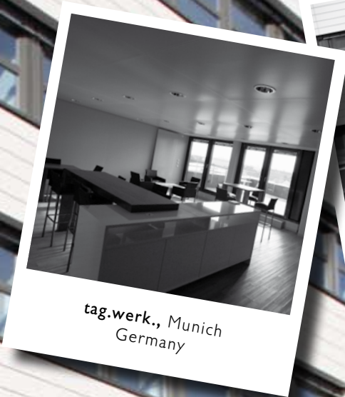
tag.werk., Munich Germany