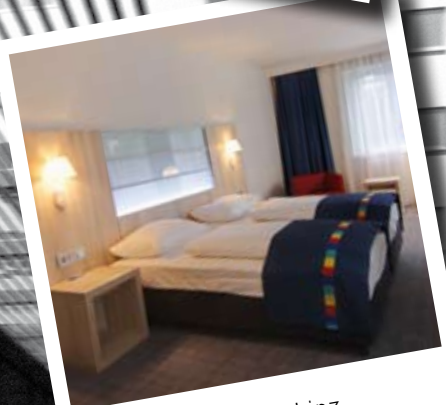
Park Inn, Linz Austria