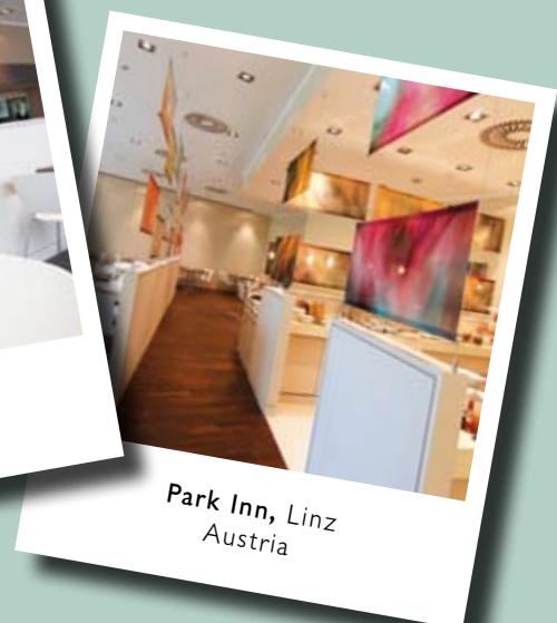
Park Inn, Linz Austria