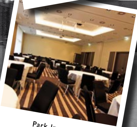
Park Inn, Linz Austria