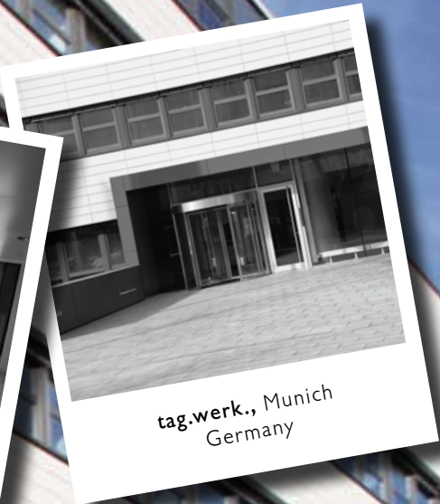
tag.werk., Munich Germany