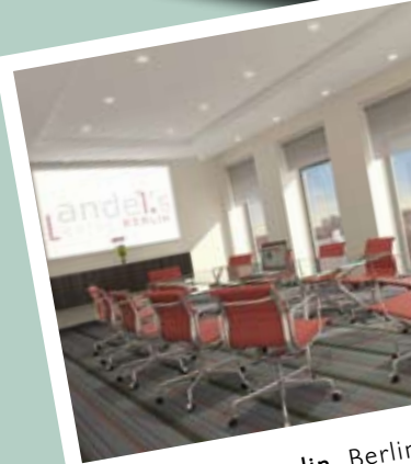
andel's berlin, Berlin conference room