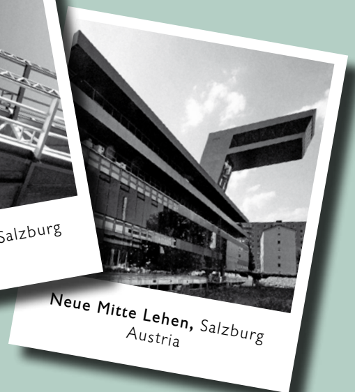
Neue Mitte Lehen, Salzburg Austria