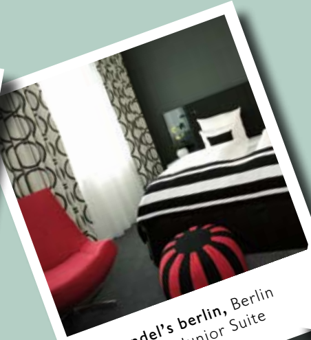
andel's berlin, Berlin Lady Junior Suite