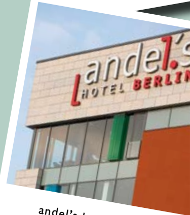
andel's berlin, Berlin frontage