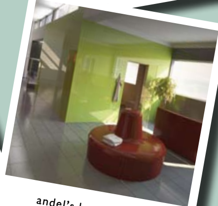
andel's berlin, Berlin Spa & Wellness