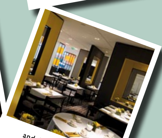
andel's berlin, Berlin delight Restaurant