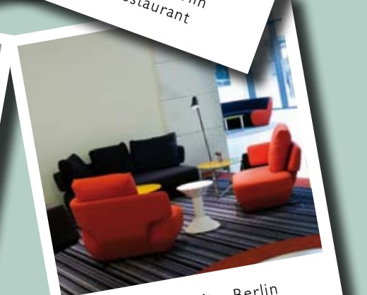
andel's berlin, Berlin Lobby