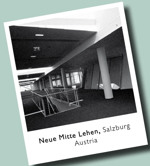
Neue Mitte Lehen, Salzburg Austria