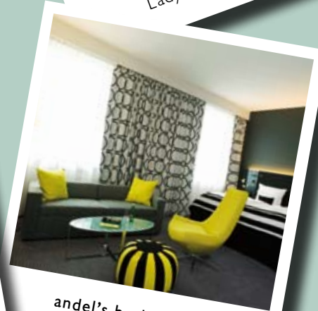
andel's berlin, Berlin deluxe room