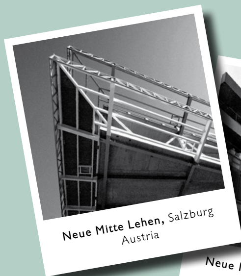
Neue Mitte Lehen, Salzburg Austria

Part of the project was handed over at the end of August 2008 to tenants, including the Salzburg Savings Bank, Flöckner bakery, dm drugs store, Libro, Saite shoe shop and a hairdresser. The area for the municipal library was handed over at the end of September, along with the neighbouring residential building including the elderly centre in November. The celebratory opening of the complex finally took place on 9 January 2009.