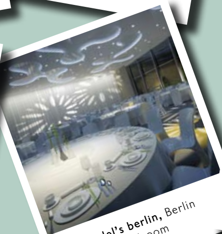
andel's berlin, Berlin ballroom