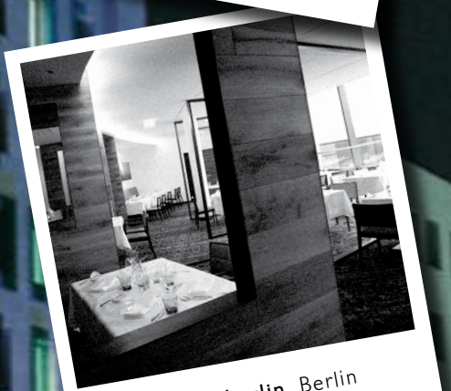
andel's berlin, Berlin Restaurant a.choice