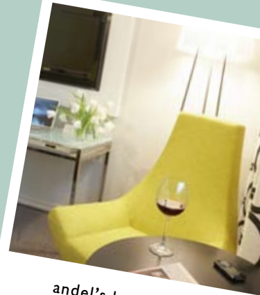
andel's berlin, Berlin deluxe room