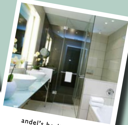
andel's berlin, Berlin bathroom