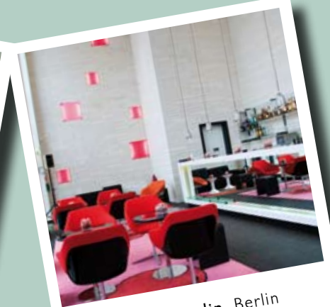
andel's berlin, Berlin oscar's brasserie