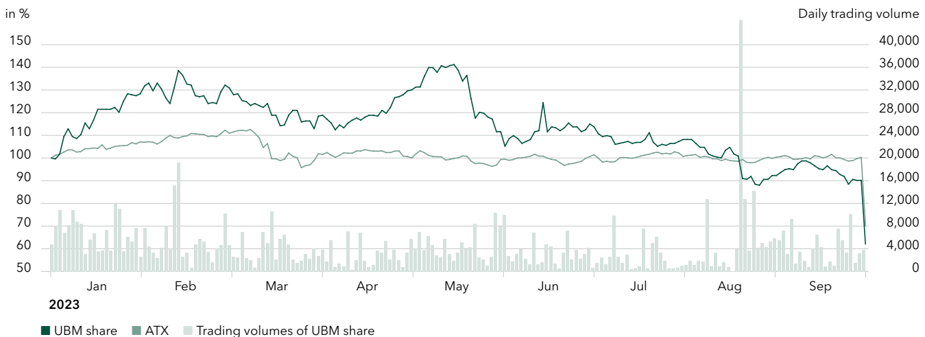
Performance of the UBM share vs. ATX and trading volumes from January to September 2023

The share capital of UBM Development AG totalled € 52,305,260.00 as of 30 September 2023 and is divided into 7,472,180 shares. The syndicate comprising IGO Industries and the Strauss Group continued to hold 38.8% of the shares outstanding at the end of the first half-year. In addition, the IGO Industries Group held 7.0% of UBM outside the syndicate. A further 5.0% were held by Jochen Dickinger, a private investor. Free float comprised 49.2% of the shares and included the 3.9% of the shares held by the Management and Supervisory Boards. Most of the other free float was held by investors in Austria (74%) and Germany (13%).